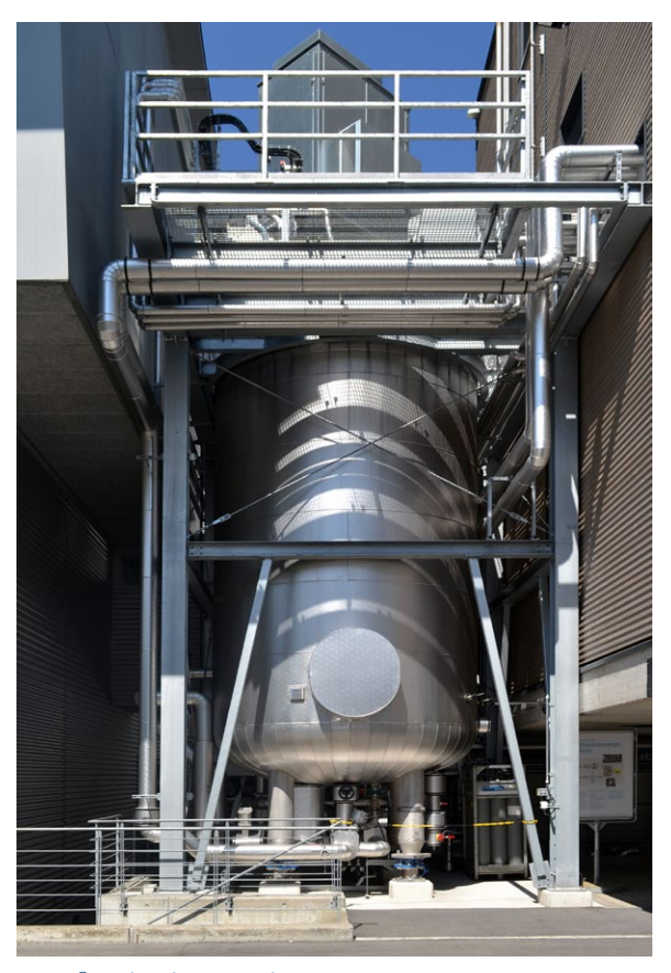
BiON<sup>®</sup> technology, methanation reactor

The BiON<sup>®</sup> anaerobic technology used in the process has key advantages over conventional technologies. Impurities in the raw gas do not affect the process. In addition, momentum is maintained in on-off operation: after a quick stop, the system starts up again just as reliably. This way production rates can always be flexibly controlled, from standby to full capacity. And since almost no energy is needed for slow start-up of the reactors or rinsing of the systems, BiON<sup>®</sup> also scores in terms of environmentally friendly operation. The technology is also easily scalable and available in various sizes.